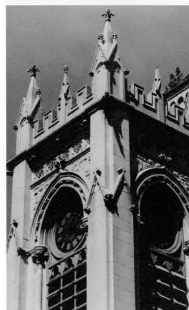
Annunciation Greek Orthodox Church, N.Y.C.