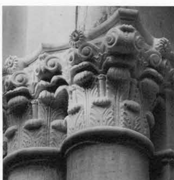
New capitol, Fleming School.