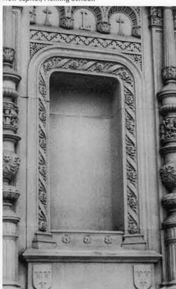
Niche at Carnegie Mellon School of Fine Art.