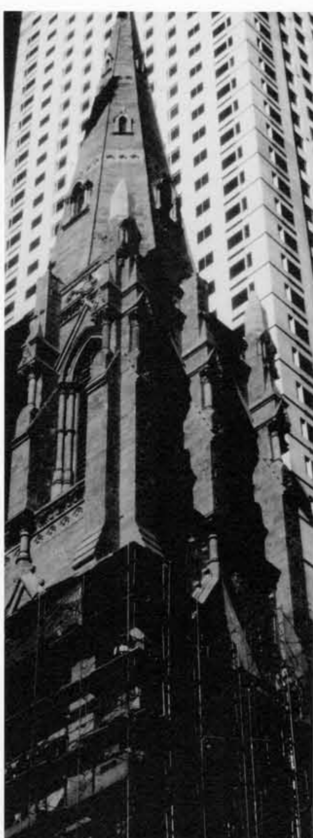
Fifth Avenue Presbyterian Church.