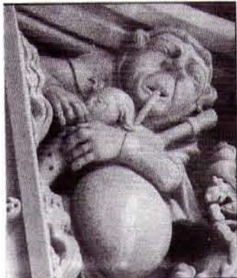
Carvers based the bagpiper in the medieval niche on a 14th century Gothic piece in Beverly Minster in England.

A computer lathe also carved out stones for the capitals, columns and statues added to the niches. Carvers, of course, chipped away at the rough cut pieces to form the final product.